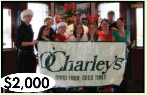
O'Charley's in O'Fallon had a pancake breakfast with Santa!