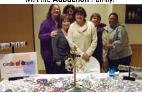
Circle of Hope bracelets, who gave us a portion of their proceeds, thank you!