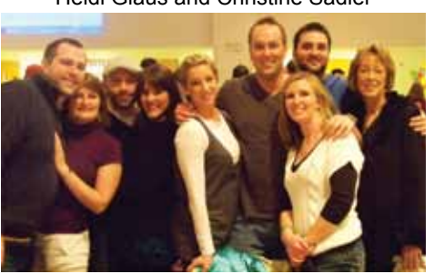
The Buchanan Table at the end of the night!

mind off my treatment, and what girl doesn't love to shop?"