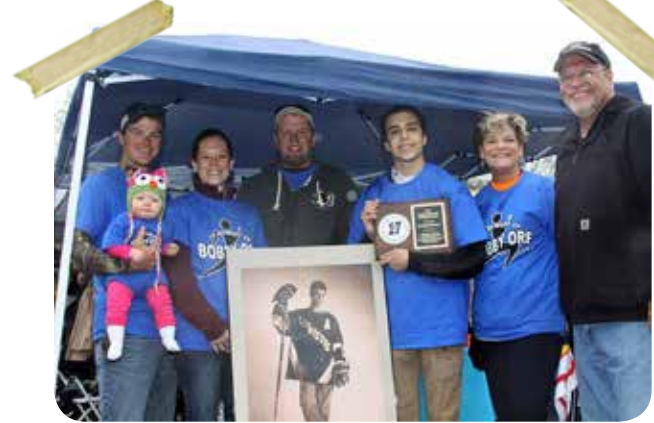
2013 Bobby Orf #17 Scholarship Recipient