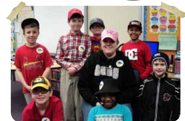
Green Pines Elementary