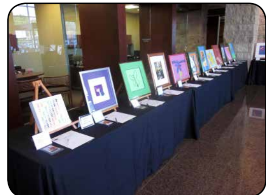
Art on display