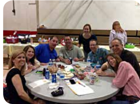
Jake's Crew Trivia Night

There have been some absolutely AWESOME Third-Party Events so far in 2014! These events range from neighborhood lemonade stands, bake sales, trivia nights, golf tournaments and more! Thanks to everyone for supporting our mission: helping kids with cancer...be kids!