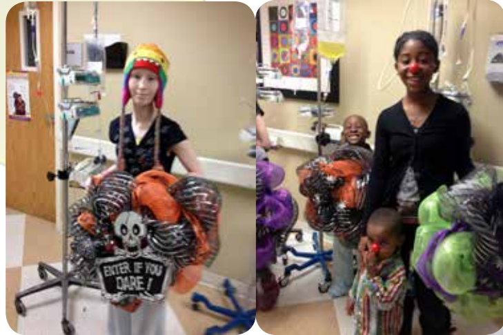
Halloween "wreaths" during Arts & Crafts