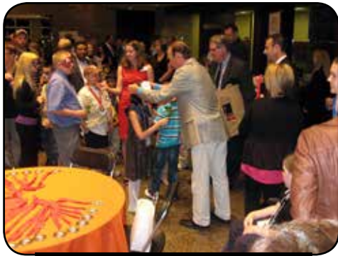
Patient artists receiving awards