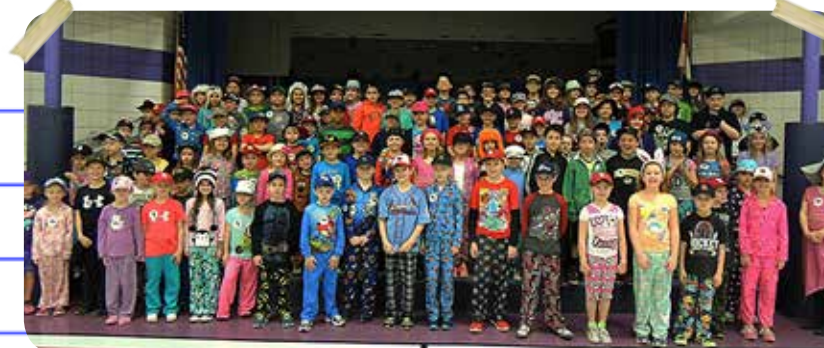
Eureka Elementary School