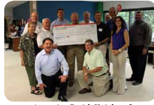
Ascension Parish Knights of Columbus Golf Tournament