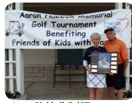
Aaron Hubbell Golf Tournament

February - BMO Touch the Heart of a Child- Raised $3,500