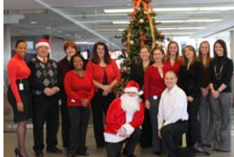
Commerce Bank raised $1,860 during its annual Caroling for Kids event, collecting money while employees sang carols!