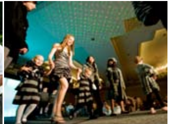
You already know about the Fashion Show and the superstar models who captivated us! (Pg. 1)