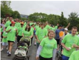
The Walk/Run kept it going, with our largest crowd ever helping raise over $40,000!