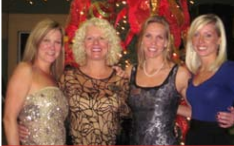
• Wellbridge Athletic Club collected toys at their annual Holiday Party, and also raised money through a silent auction!