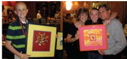
The first ever Art Therapy Gallery/Auction, Art from the Heart, raised $22,000 and lots of smiles from artists.