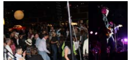
Groovethang performed again in 2010, to the delight of all at the Kemp Auto Museum, which raised $5,000.