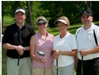
The Golf Tournament was no exception, continuing its tradition of excellence, raising $120,000!