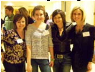
A SOLD OUT Trivia Night started the year off on the right foot, raising over $18,000!