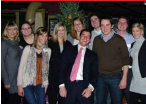
• The Young Friends held a happy hour at the Dubliner with free appetizers and drink specials. The cost to get in? A toy for Friends! Visit YoungFriendsofKids.com