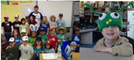
Hats On Day, started in 1995, celebrated its 15th Anniversary this year, raising almost $40,000