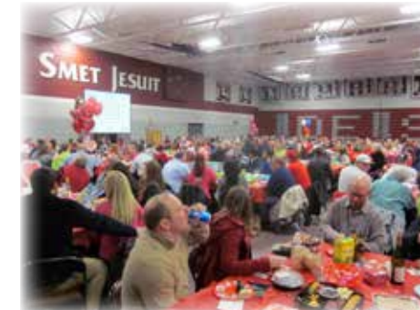
Trivia Night - Raised $17,000 *Funds patient, sibling and parent support groups.

YOU didn't just participate and support our events, YOU created endless smiles - THANK YOU