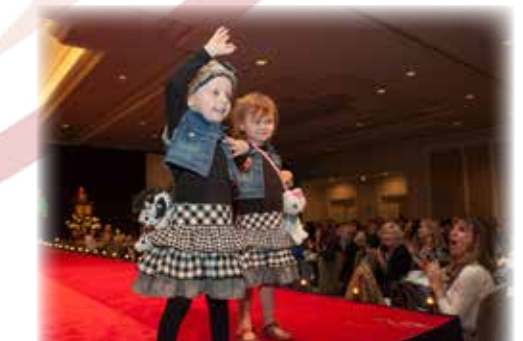
Fashion Show & Boutique - Raised $171,000 *Makes our kids feel important and beautiful.