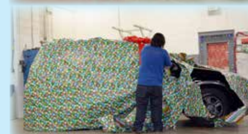
Two families unwrapping their new cars refurbished by Gapsch CARSTAR!