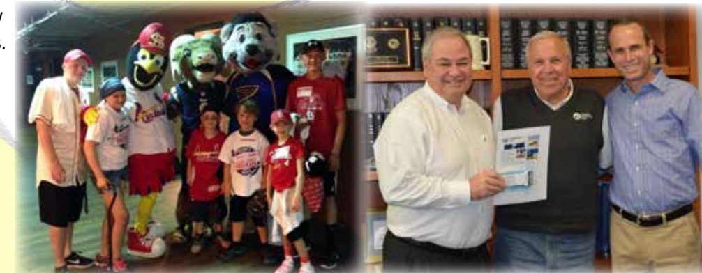
Patients and siblings enjoying a Cardinals game