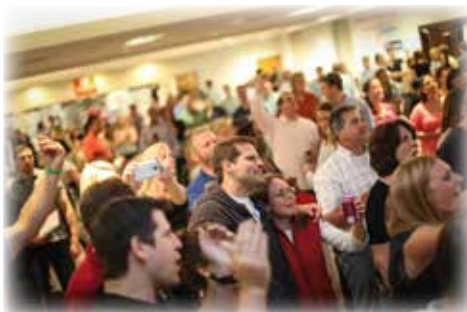
People cheering at Mouse Races fundraiser!

Toys and Toddlies Holiday Toy Drive - Collected more toys than ever!