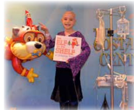
Patient finding Elf on the Shelf!