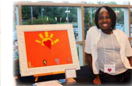
Art from the Heart - Raised $47,500 *Funds 40 weeks of Art Therapy, which helps build self-esteem.