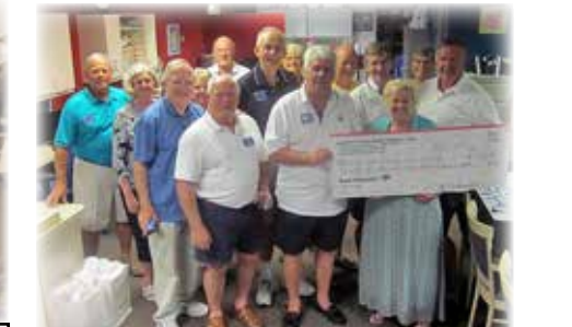
Ascension Knights of Columbus Golf Tournament