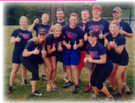
Young Friends Kickball Team

To learn more about the Young Friends of Kids with cancer, visit www.friendsofkids.org !