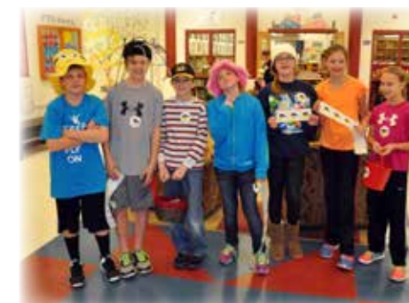
Hats on Day - Raised $38,000 *Honors a patient's appearance. Funds Survivor Scholarship Program.