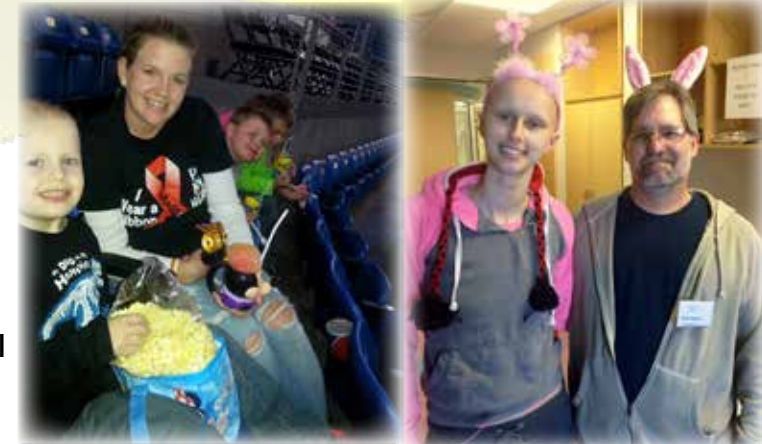
A patient and his family attending Disney on Ice!