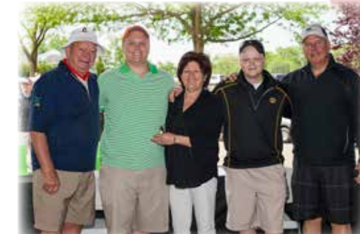
Golf Tournament & Auction - Raised $197,000 *Funds special assistance gifts, family parties, treatment center meals and snacks.