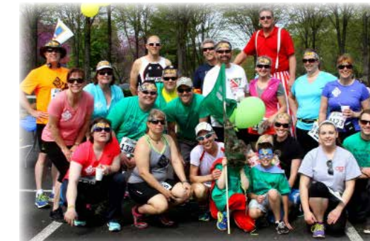
Walk with a Friend Run/Walk - Raised $55,000 *Shows the importance of family togetherness. Keeps the toy closets full.