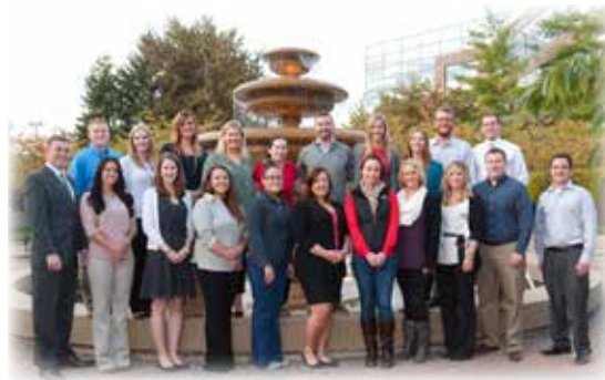
The 2014 Young Friends Board Members