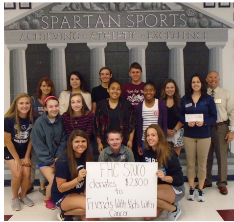
FRANCIS HOWELL CENTRAL HIGH SCHOOL "MR. FHC" RAISED $2,800