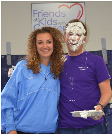
PARKWAY WEST HIGH SCHOOL "CASH FOR CANCER" RAISED $1,400

We are so grateful for the support of these young kids making a big difference in their community by helping kids with cancer...be kids!