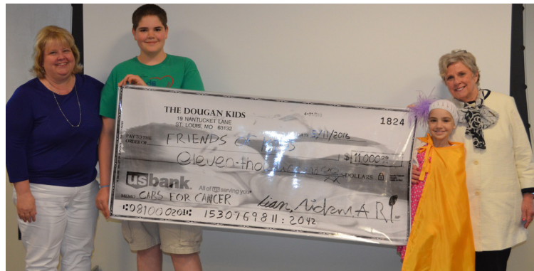
"ZUCKER/DOUGAN HOT WHEELS AUCTION" RAISED $11,000