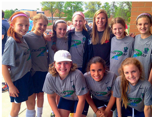
KIRKWOOD HIGH SCHOOL "KIRKWOOD KICKS FOR CANCER" RAISED $1,800