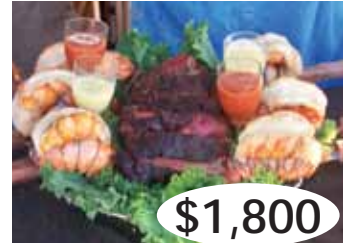
Koman Group's Jazz Fest