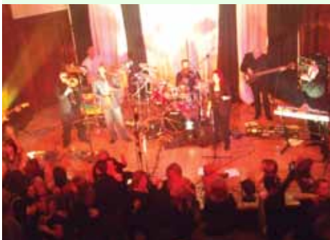
Groovethang performs the hits!

ST. LOUIS - Friends' first ever benefit concert brought in a great crowd of fans, those of Earth, Wind & Fire, Steely